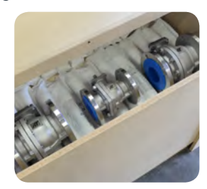
2. Place the CFTs on the bottom of the carton to form a protective base.