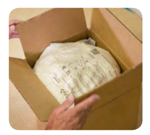
2. Place the bag into the carton and nestle the product onto the expanding cushion.