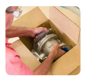
Select the proper bag length and amount of Instapak® foam.

With the touch of a button, you can create a foam-filled bag, which, moments later, will form into a perfect contoured protective cushion.