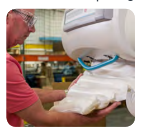
Select the size of your tubes and the length of the chain.

Produce continuous foam tubes on demand, or batch for later use or delivery to decentralized packaging stations.