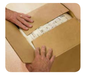
Place a second bag on top of the product and close the carton flaps to form a top cushion.