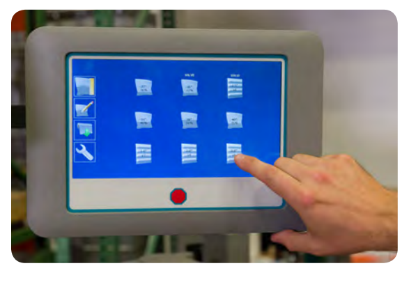
Industrial Grade Touch Screen Display