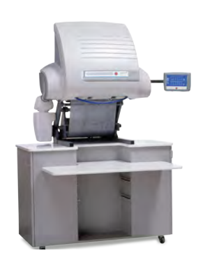
19-INCH BENCHTOP MODEL