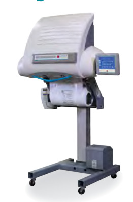
19-INCH FLOOR MODEL