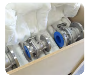
3. Use a foam filled bag to create a top cushion, or additional CFTs to wrap the product for corner and edge protection.