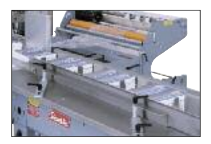
Adjustable Flight Lug Infeed