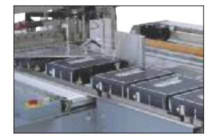
Product Spacing Infeed Conveyor