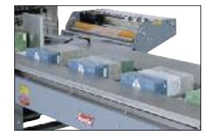
Adjustable Flight Bar Infeed

By selecting just the right combination of options, you can customize your Shanklin A-Series Automatic L-Sealer for the ultimate performance, efficiency and value!