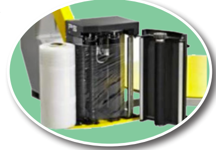
Quick & Easy Film Loading

Wrap palletized loads in less than a minute... any size, shape or weight.