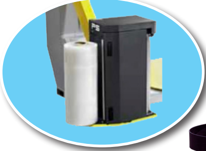
Safe Film Carriage