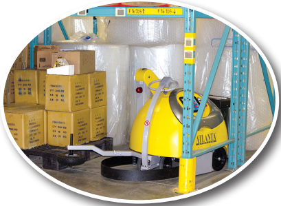
Store out of the way