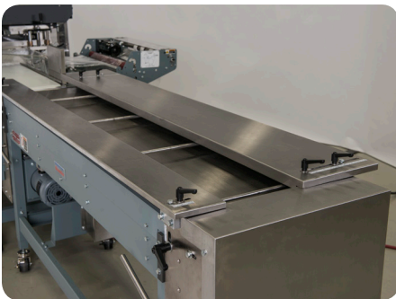
Adjustable Flight Bar Infeed