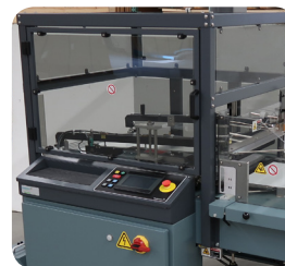
New Guarding featuring Dual Monitored Safety Circuit