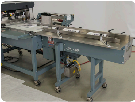
Adjustable Flight Lug Infeed