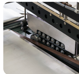
Automatic Film Puller