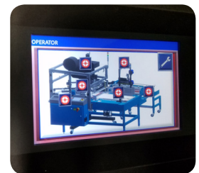
Intuitive Picture-Based Touchscreen