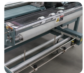
EZ Load Film Unwind