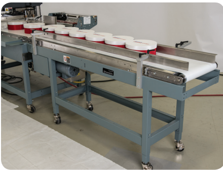
72" Product Separating Infeed