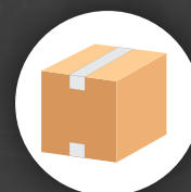
TOP & BOTTOM SEAL