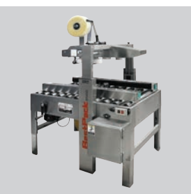
FOOD GRADE 304 STAINLESS STEEL This machine is available in 304 stainless steel which is food grade safe for food applications.