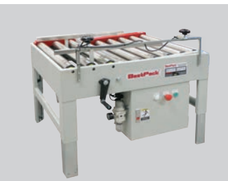
INDEXER STATION The indexer's function is to separate and time cartons going into the carton sealer.

The low tape light allows the operator to prepare a new roll of tape. The no tape alarm will inform the operator of the error so that the carton may be resealed.