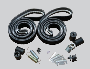
SPARE PARTS KIT "Spare Parts Kits may vary based on machine" Minimize downtime with BestPack's Spare Parts Kit.

This 39.5" long conveyor is a great work platform and allows for staging of cartons on the infeed and the exit.