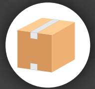
TOP & BOTTOM SEAL

110 VOLTS SINGLE PHASE - 20 AMPS Power Requirements