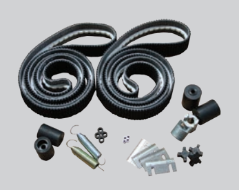
SPARE PARTS KIT *Spare Parts Kits may vary based on machine* Minimize downtime with BestPack's Spare Parts Kit.

Aluminum frame interlock safety gates can be added to the carton sealer for an extra layer of protection. These interlock safety gates protect the operator from all of the moving parts of the carton sealer.