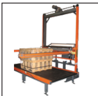
OPTIONAL TOP SHEET DISPENSER (Both inline / incycle)

Automatic machines are customized to meet customer specifications. Many custom options are available.