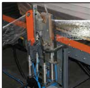
FILM TAIL HEAT SEALER