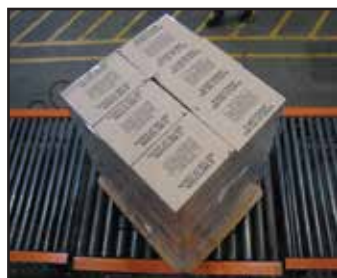
TURNING CROSS CONVEYOR