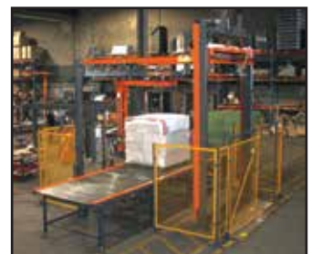
PRTA-2200 WITH OPTIONAL TOP SHEET DISPENSER