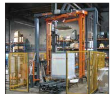
OPTIONAL TOP PLATEN