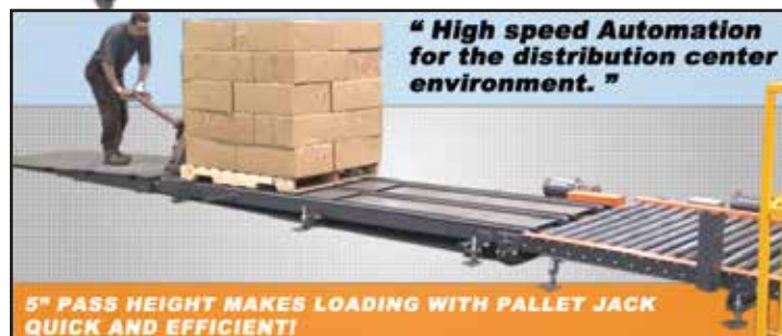
PALLET JACK LOADING OF AUTOMATIC STRETCH WRAPPERS

"High speed Automation for the distribution center environment."