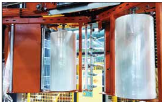
DUAL FILM ROLL CARRIAGE