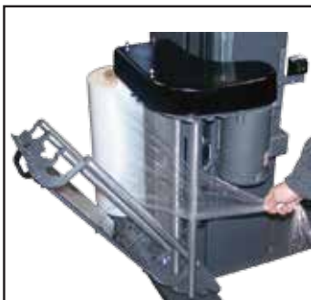
20" POWERED PRE-STRETCH FILM CARRIAGE

Maximizing film efficiencies, durability and operator safety are the cornerstones to the Phoenix carriage design.