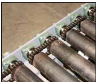
CAST IRON FLANGE BEARINGS